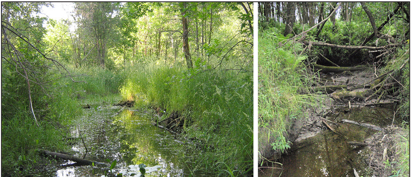
Low flow conditions in Willow Creek in June 2006 (left) and even lower/no flow conditions in July 2012 (right). Low flows can cause low dissolved oxygen levels and other conditions that are harmful to fish and aquatic insect communities.